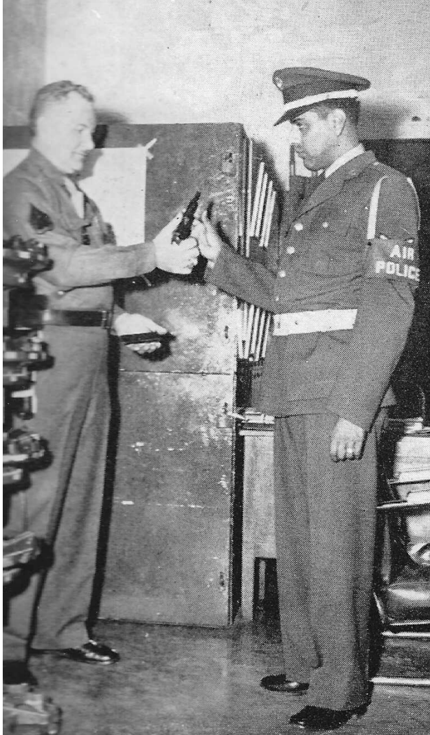
.45 Automatic is issued to man going on duty