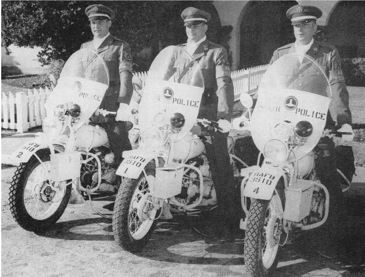
3510 Air Police Squadron motorcycle mounted officers.